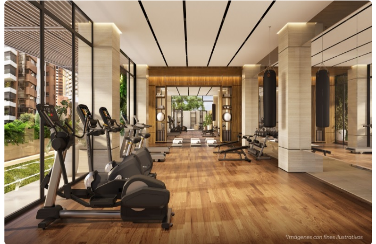
*Imágenes con fines ilustrativos