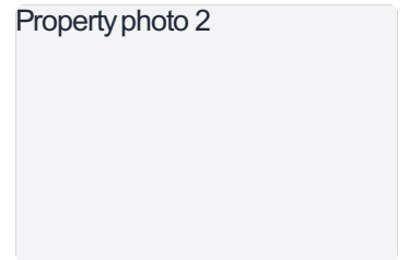
Property photo 2